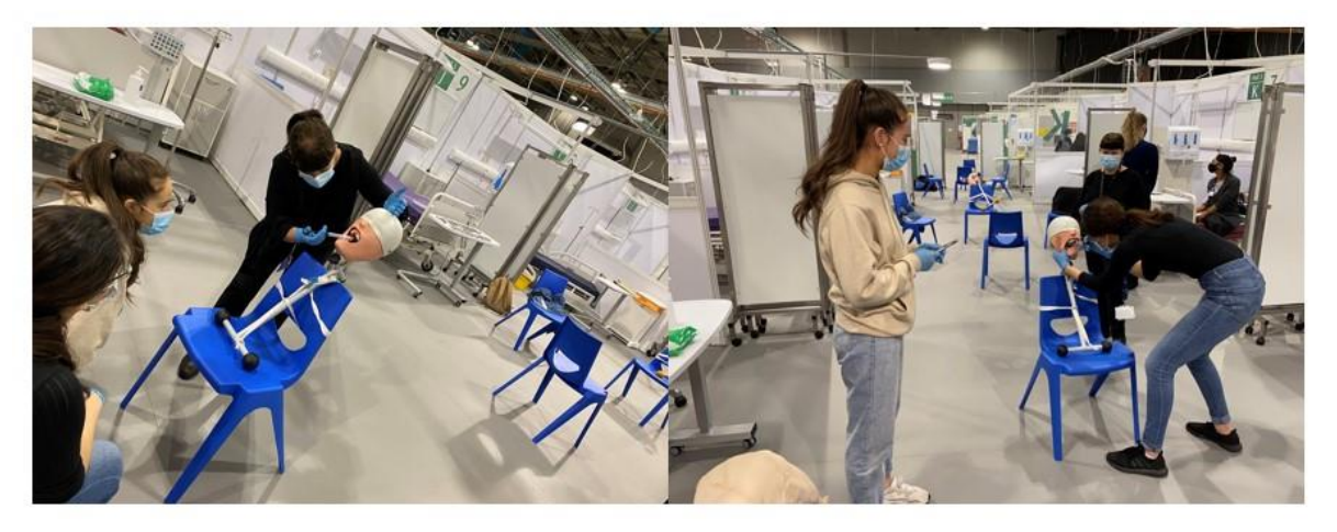
Figure 4 Subsequent on campus practical clinical skills teaching at the Louisa Jordan National Clinical Skills Hub

Virtual learning cannot fully replicate on-campus teaching of practical clinical skills. When lockdown restrictions were eased in August 2020, this allowed for face-to-face sessions where students could demonstrate the practical application of skills they had acquired in the virtual setting (Figure 4). This novel wiki approach to the LA symposium provided an innovative and engaging alternative which enriched the subsequent on-campus practical sessions, so much so, that it will be incorporated into future teaching in this area.